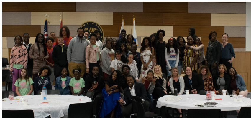
Expect Respect students turned out for a fun evening focused on healthy relationships at Night Out With Bae.

The night before Valentine's Day, the Prevention program hosted its annual Night Out With Bae at Orlando Police